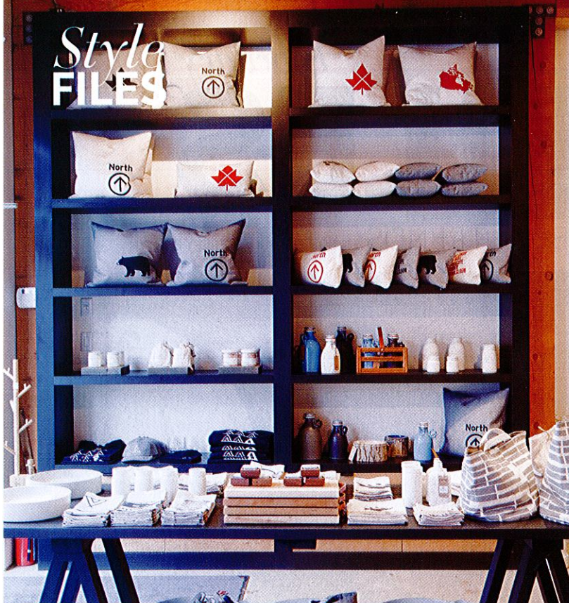
Pillows (on shelves) by Nicole Tarasick, from $76 each.