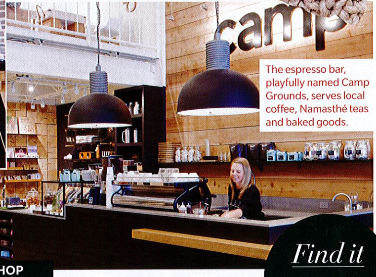
The espresso bar, playfully named Camp Grounds, serves local coffee, Namasthé teas and baked goods.